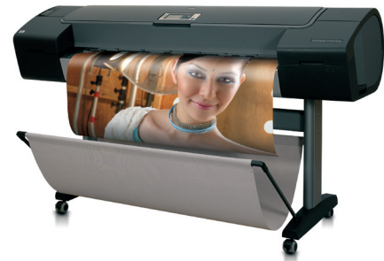
HP DESIGNJET Z3100