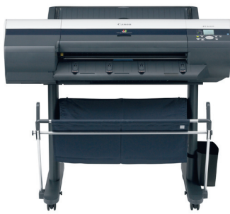
CANON imagePROGRAF 8100