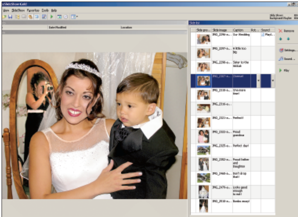
MySlideShow Gold presentations are easily configured using the Settings and Sound options at screen right.

lines the process. Drag and drop images into the slide list window to create a new show. All characteristics of the show are set through the Settings and Sound options. Click the Setting icon to control font styles, transitional effects, zooms and pans; click Sound to add or modify background audio tracks. Although the slideshows work as AutoRun CDs, the presentations include 10 different commands accessed by right-clicking the screen. The commands include navigation forward, backward, or to a specific frame, starts and pauses, image data and image rotation. Viewers can also copy and save individual images.