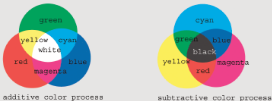
Figure 1. Both the additive and subtractive color models are seen here. RGB or additive colors are based on the mixing of light. CMYK colors are based on removing light from a page by adding colorants.