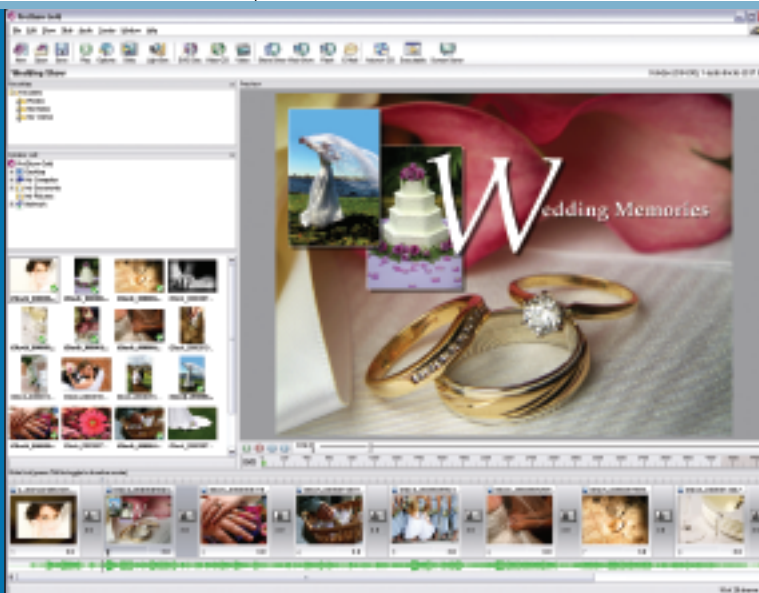
Photodex Proshow Gold 2.6