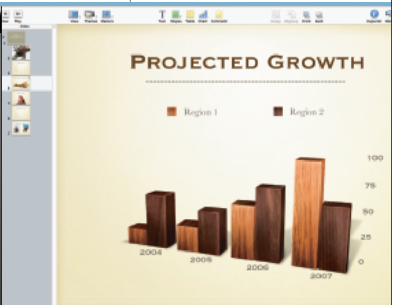
Apple Keynote 3