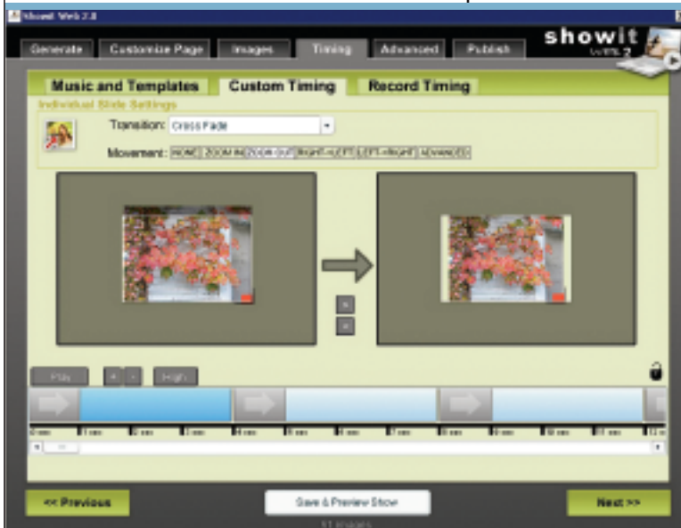
Showit Software Showit Web 2

that can be edited using Bézier curves. Keynote supports high-definition monitors with resolution up to 1,920x1,080 pixels, and it lets users apply sticky notes to photos that won't appear when the application is in the presentation mode. iWorks 06 includes text/graphics editor Pages 2 and Keynote 3. It has an MSRP of $79. www.apple.com ■