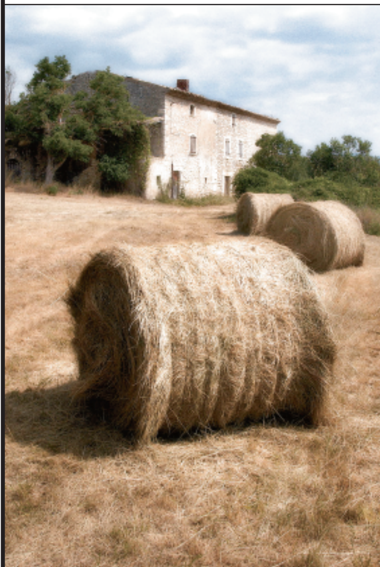
After applying the filters, flattening the image, and adjusting the curves and levels in separate layers, my image has a beautiful Old-World look.

Add curves and levels adjustment layers to tweak the color and tone as needed.