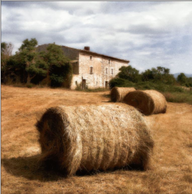
Here is the final image, with warmer tones painted in and final square cropping.

12. I print my image on a nice off-white textured watercolor paper. My favorite art papers are Hahnemuhle German Etching and Arches Infinity. I print with the Epson 10000 series printers with pigment inks.