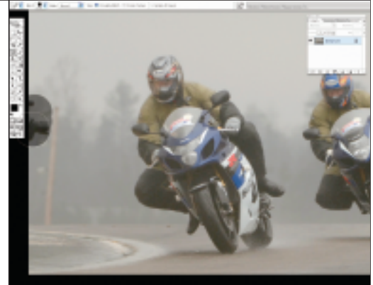
Top: At left is the original image with an unwanted lens poking into the frame. At center you see the telltale smudge from the Photoshop CS Healing Brush. At right is the result of CS2's Spot Healing. Above is the tool in action—no sampling, just a swipe from the brush.

There's much more to see in Adobe Photoshop CS2. In the months ahead, Professional Photographer will continue to guide you through the features that best suit your workflow.